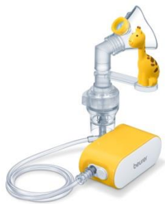
IH 58 Kids nebuliser