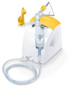
IH 26 Kids nebuliser